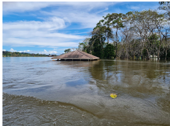
Suriname Flooding 2022