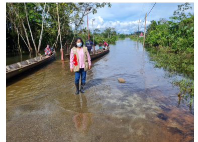
Photos captured by CDEMA's Advance Team - Suriname Flooding 2022