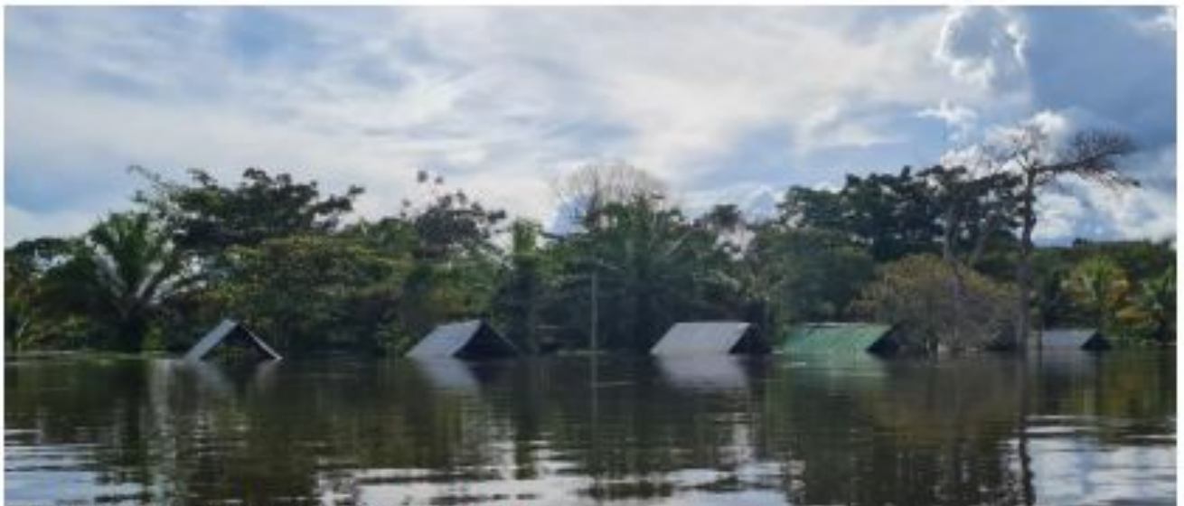
Figure 4: Flooding of the Suriname River - Klaaskreek