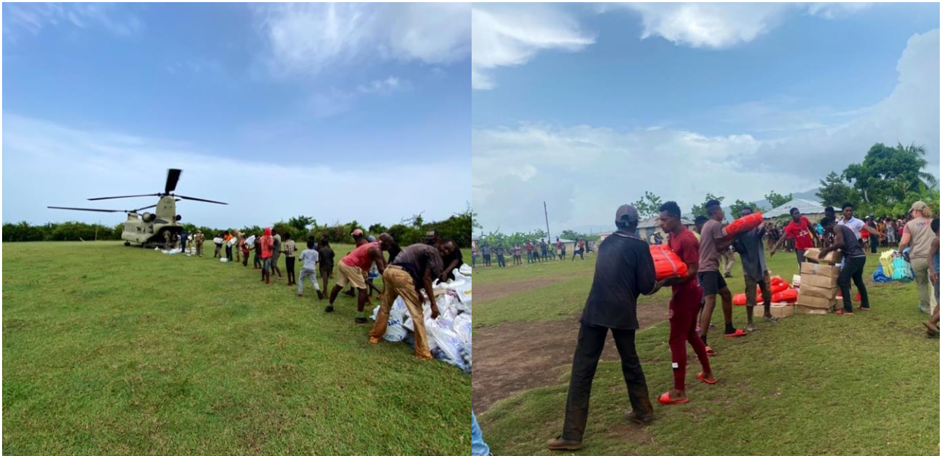
Relief supplies received by air in Port au Prince on September 1.