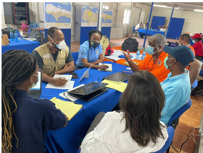
Members of the CARICOM Operational Support Team (COST) in discussion with partners in Haiti - 26 August 2021