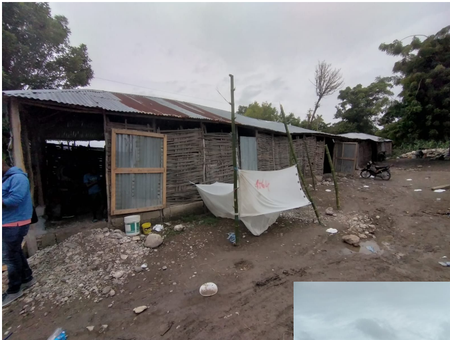
Shelter situation in Les Cayes, Haiti