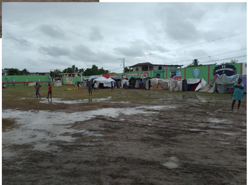
Shelter situation in Les Cayes, Haiti