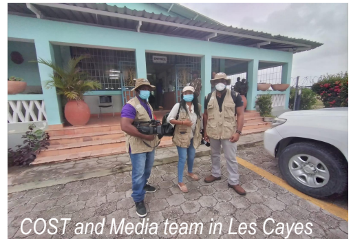
COST and Media team in Les Cayes