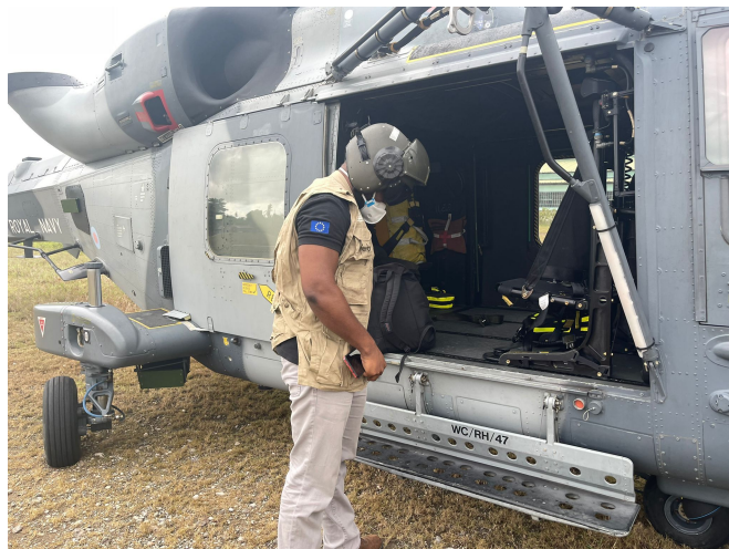
Member of the CARICOM Operational Support Team (COST) in Les Cayes, Haiti - 26 August 2021