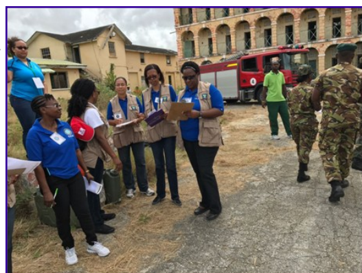
Below: HA/DR Evaluators at the Glendairy Resort checking their Data Collection Sheets