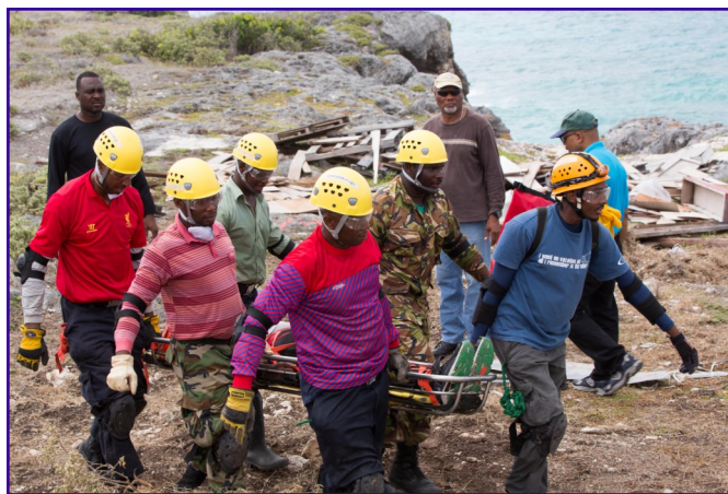
Top and Below: Participants exercising search and rescue techniques during the USARLL training at the BDF's Paragon Base in Barbados.

The training was financed through CDEMA's Country Directed Fund (CDF) from resources provided to the CDEMA CU under the African Caribbean Pacific-European Union Natural Disaster Risk Management in CARIFORUM Countries Programme (ACP-EU-CDEMA NDRM).