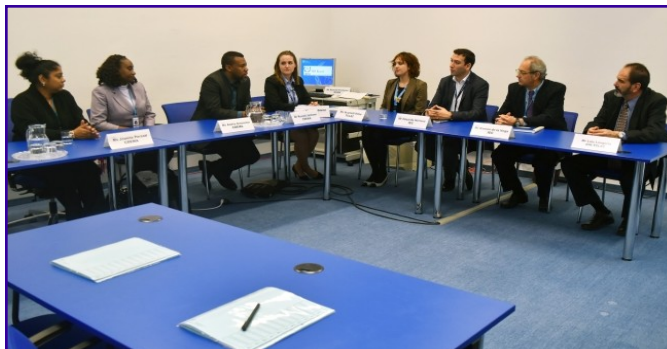
The CDEMA delegation and the IAEA counterparts discussing their future cooperation.