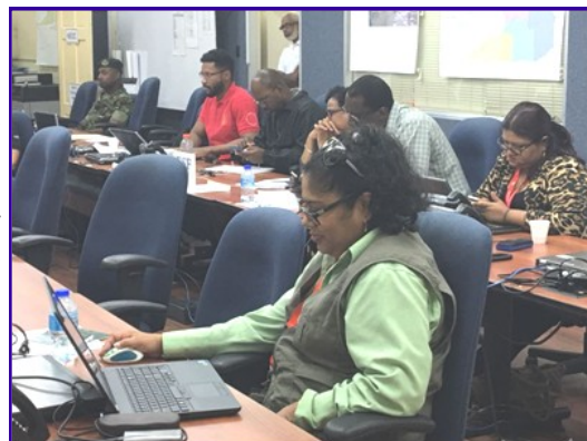
The Southern Sub-Regional Focal Point takes over as the Alternate RCC in Trinidad on Saturday June 10, 2017