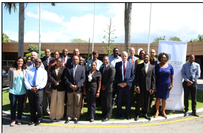
Regional Coordinating Workshop and Closing Ceremony attended by representatives of the 4 Agencies: CDEMA, CARPHA, CARICOM IMPACS and RSS in Port of Spain on Thursday January 26 th , 2017.

The agencies gave the Programme a thumbs-up as they believe the benefits derived would have a lasting effect in the Region. Participants also expressed that they are now better prepared to respond to crises and potential conflict situations.