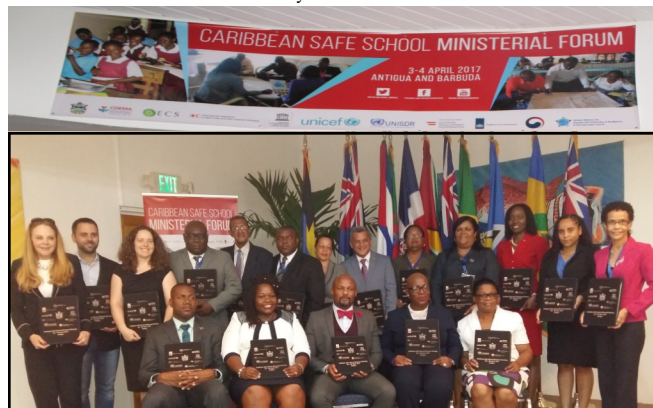
Caribbean Ministers of Education, other high-level officials and international partners pose with the signed Antigua and Barbuda Declaration for School Safety during the Caribbean Safe School Ministerial Forum.