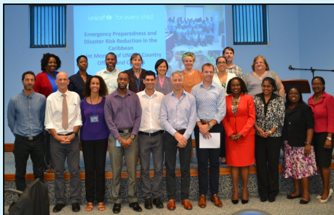
Participants at the Joint Meeting of UNICEF Country Offices and CDEMA held in Barbados—February 20-21, 2017.

tion and DRR in order to build resilience was identified as a key cross cutting strategy.