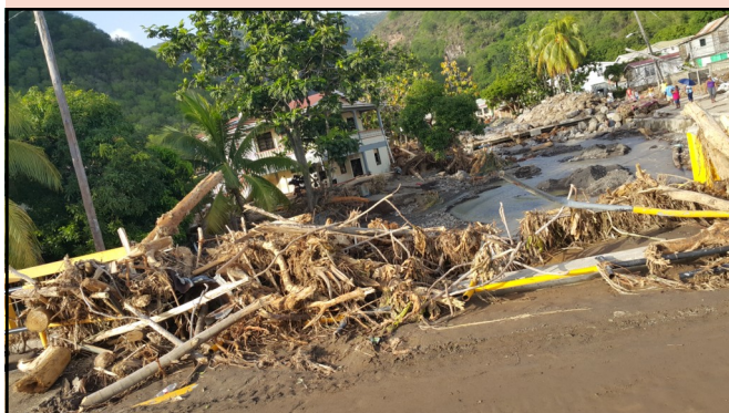
A section of the Coulibistrie community in Dominica post TS Erika, 2015.

A first draft of the CDM Legislation for Dominica was developed in 2013 under the CDM Harmonized Implementation Programme (CDM HIP) financed by UK AID, DFATD (now Global Affairs Canada) and the Australian Aid Agency. The passage of Tropical Storm Erika, which devastated Dominica in August 2015, provided an opportunity to examine and address gaps in the draft legislation.