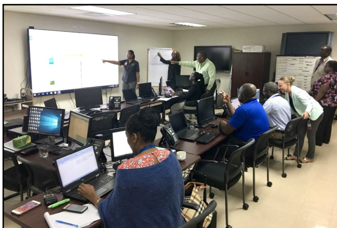
Representatives from the 4 Regional Agencies discussing events being logged into the Virtual Crisis Room in the Regional Coordination Centre at the CDEMA's Headquarters.